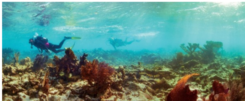
Elkhorn coral, Carysfort Reef South, Florida, 2010